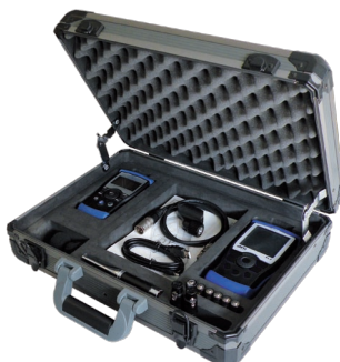
Exel Acoustic Set