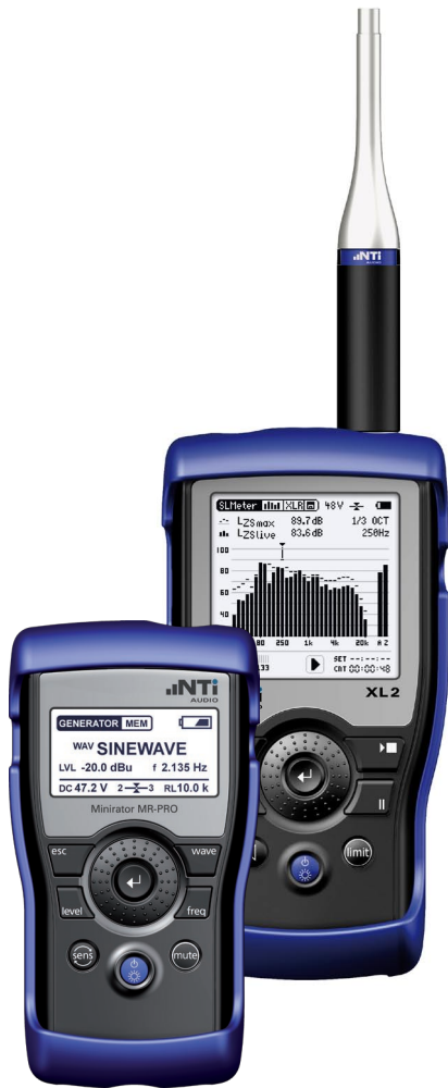
Exel Line: Minirator MR-PRO with XL2 Audio and Acoustic Analyzer