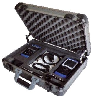
Exel Acoustic Set