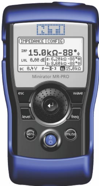
Test results of a 5m audio cable with pin1 failure