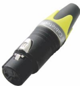
Cable Test Adapter