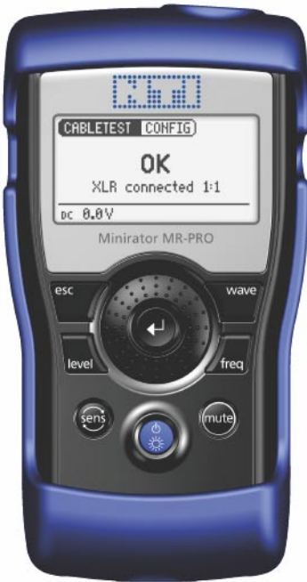
MR-PRO measures cables with pin 1 failures

The Minirator MR-PRO generates audio test signals for commissioning and servicing of audio installations. Additionally it measures the impedance of connected devices, of 70V/100V speaker systems and audio cables. This application notes describes the cable testing feature including verification of any false pin1 connection to the cable shield.