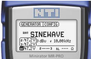
Phantom power screen Minirator MR-PRO

The MR-PRO displays the “DC” field continuously including the average voltage value of Pin 2 and Pin 3 of the connection. By moving the main cursor over the “DC” field, a popup panel appears showing the two individual phantom power voltages on pin 2 and pin 3.