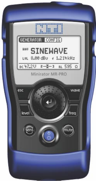
Minirator MR-PRO measures phantom power

Phantom powering is ubiquitous in professional audio. The MR-PRO includes special features to continuously monitor and display DC voltages present at its output. The MR-PRO may be connected to the microphone input of the mixing desk and continuously measures the actual effective phantom power with or without load. This application note describes how to test conformity of the phantom power source in use according to the relevant IEC 1938 standard.