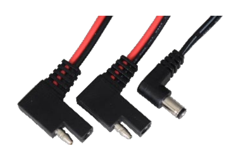
Tracer Battery Adapter Cable

The Tracer Battery Adapter Cable connects the Tracer battery pack to a NetBox or an XL2 Analyzer. It ensures that the connected instruments start up properly if the battery has been completely discharged.