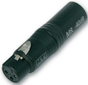
Minirator -40dB Adapter

Thank you for purchasing the Minirator -40dB Adapter! This attenuator can be utilized to generate high quality microphone level signals. It increases the signal-noise-ratio for low level Minirator signals by -40dB.