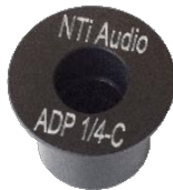
1/4" Calibration Adapter for M4261 Measurement Microphone

The battery-operated Class 2 Sound Calibrator is classified for the calibration of class 2 measurement microphones, sound level meters and other acoustic measurement equipment. This microphone calibrator delivers 114 dB at a frequency of 1 kHz.