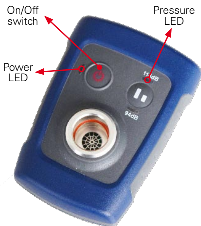
Sound Calibrator Class 2