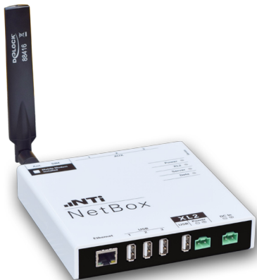
NetBox with 3G Modem