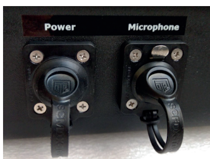
Waterproof connectors for microphone and external power supply (IP65 configuration)