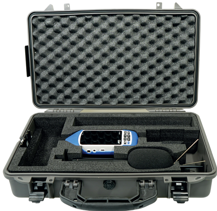
Heavy Duty Outdoor Case (equipment not included)