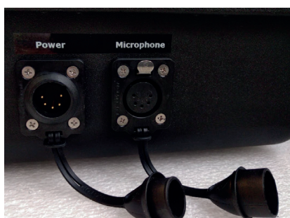
Removed protection plugs of waterproof connectors for microphone (IP65 configuration)

The splash-proof cable gland on the side of the IP43 case offers full flexibility in routing the required cable connections to the exterior. The IP65 version provides two waterproof XLR chassis connections and includes a special 5 m ASD Cable with gender change and a mains adapter with waterproof connectors.